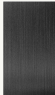
BLACKENED STAINLESS STEEL